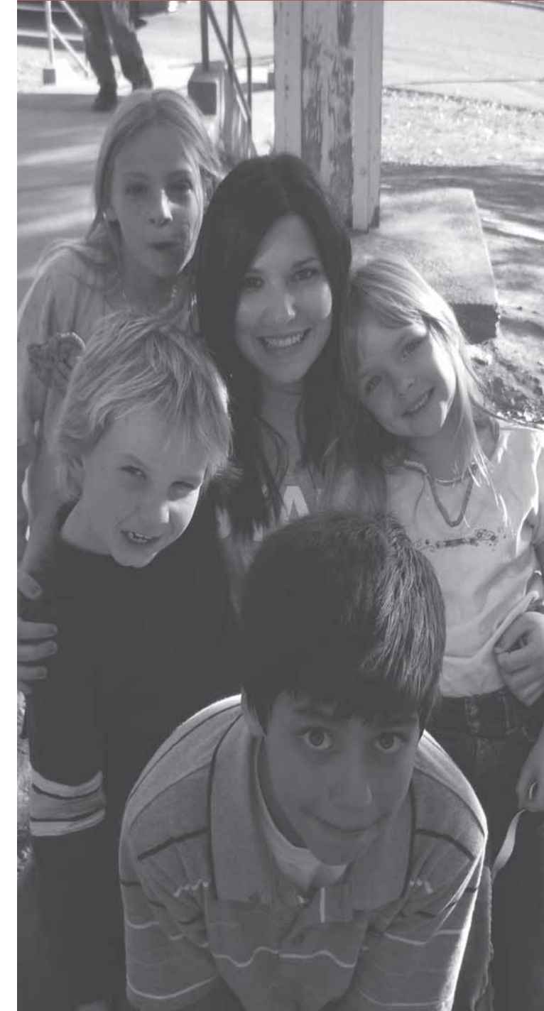
Boys & Girls Club of El Dorado County Western Slope Locations